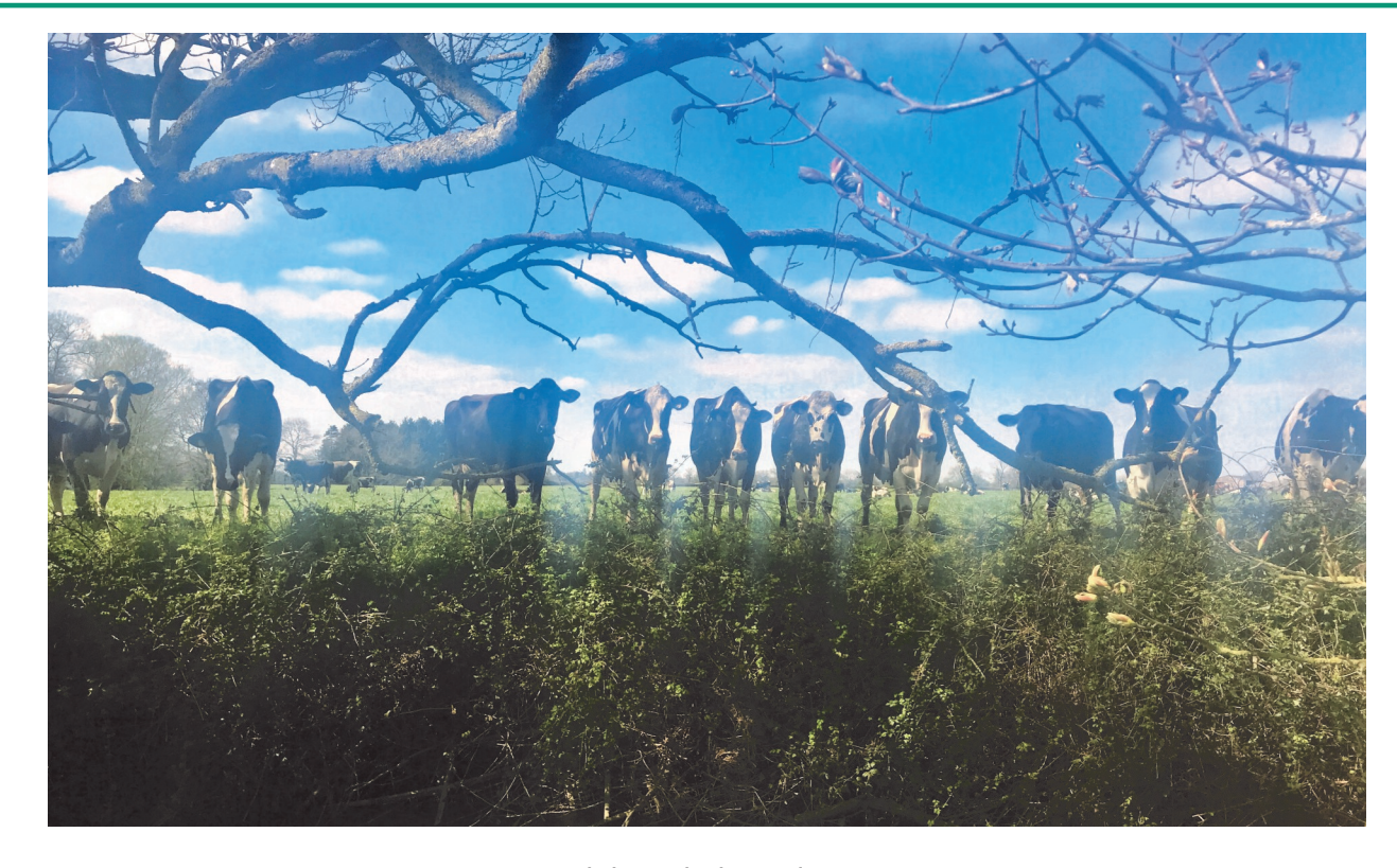
Cows viewed through the early morning mist.