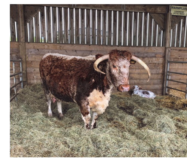
Grumbledore & her calf