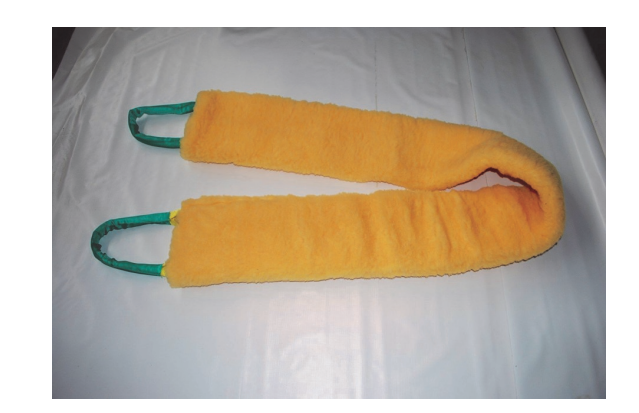
Example of padded lifting strap